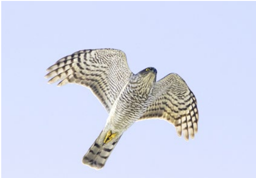
Eurasian sparrowhawk ( Accipiter nisus )