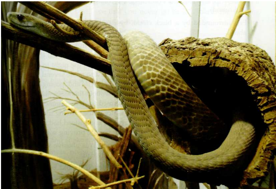
Black mamba snake

The BLACK MAMBA HAS NO THREAT FROM ANY PREDATOR BECAUSE NO ANIMAL IS ABLE TO KILL IT .