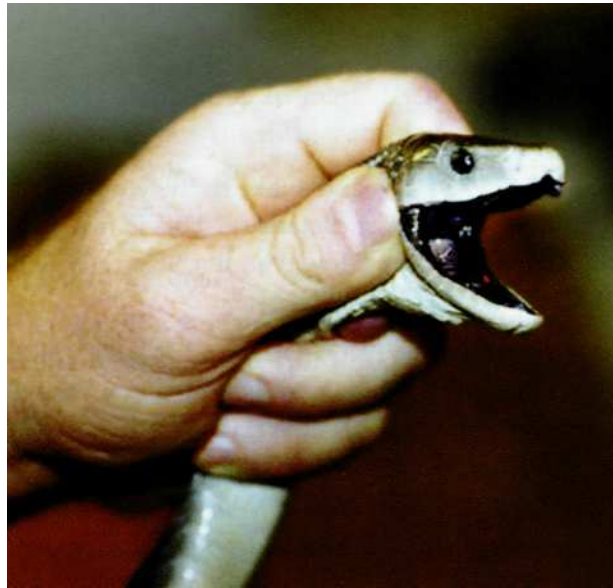
Black mamba displaying the inky mouth

The black mamba is not named for the color of its body, which is usually a shade of metal grey, charcoal, olive green, dark olive or greyish brown, and some even have light bands on their body. It is named for the HIGHLY PIGMENTED INTERIOR OF ITS MOUTH an INKY BLACK , which it readily displays when threatened to scare a predator. An adult mamba grows to a length of 2.5 m/8 ft, to a maximum of 4.5 m/15 ft. Despite its size, it is highly agile , effortlessly sliding through thorn bushes and trees.