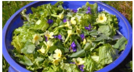
Fig. 5 Edible blossoms