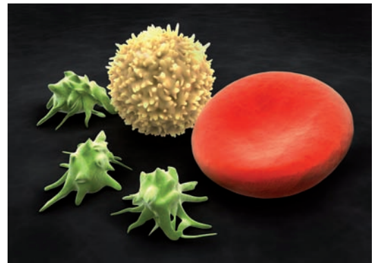
Fig. 17 Erythrocytes, Leukocytes, Thrombocytes

Azath, Acetyls-ac, Cisplat, Carbam, Chlorpr, Cortiso, Halo, Penic, Strep-p, Both, Crot-h, Lach, Phos, Rad-br, Sal-ac and Methion.